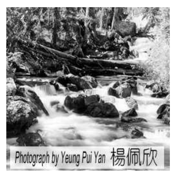
Figure 2: An example of a text inside an image.

We test the images in a couple of ways. First, we use the decompression mechanism in the baseline JPEG, which does not assume any distribution in the coefficients. We record the signal-to-noise ratio (SNR) of the resultant image as compared with the original. Second, we test with our algorithm without the discriminator function, and assumes that the DCT coefficients for all the blocks have a Laplacian distribution. Third, we examine the case where the DCT coefficients for all the blocks are assumed to have a Gaussian distribution. Finally, we test with a